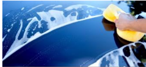
Home, Car and Industrial Care