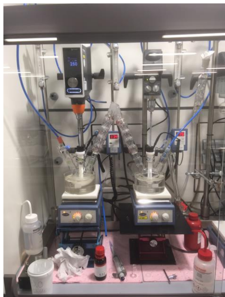
Particle sizer – Lab mixer – GPC with Fraction Collector Synthesis Setup - Rheometer