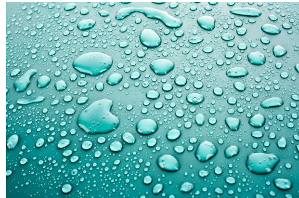
BRB Sempure 135 and BRB Sempure 230: Highly effective hydrophobic Silicone micro emulsion for home and car care industry