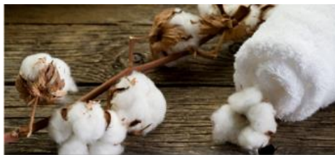
Textile and Leather