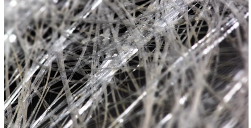
BRB Silani ® 919 HP: High purity Silane for fibre glass industry