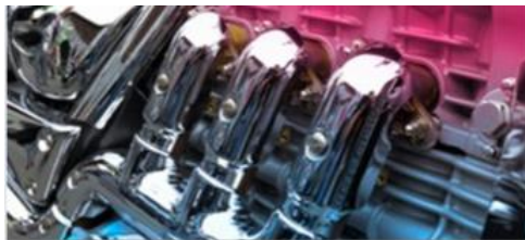
Coatings and Inks