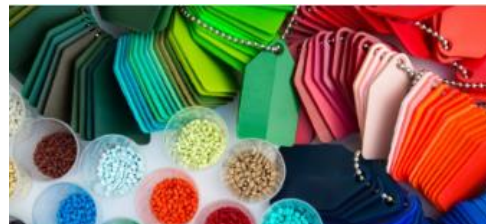
Plastic, Rubber and Composite