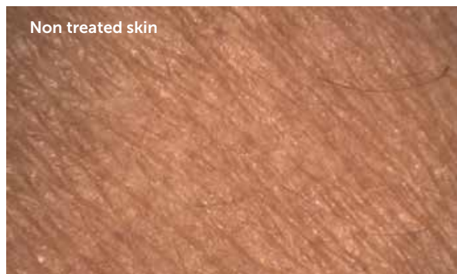
Non treated skin

A silky, non-greasy skin feel with moderate diffusion (blur) giving a natural glow