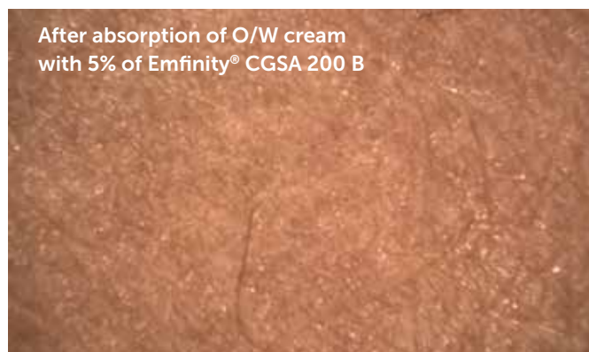
After absorption of O/W cream with 5% of Emfinity® CGSA 200 B

Instrument: Visioscope PC 35 parallel light